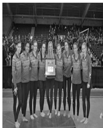
Lady Gov Gymnastic team holds their 4th place trophy