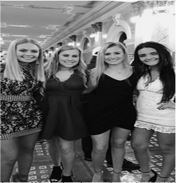
A group of friends take a picture at the capitol.