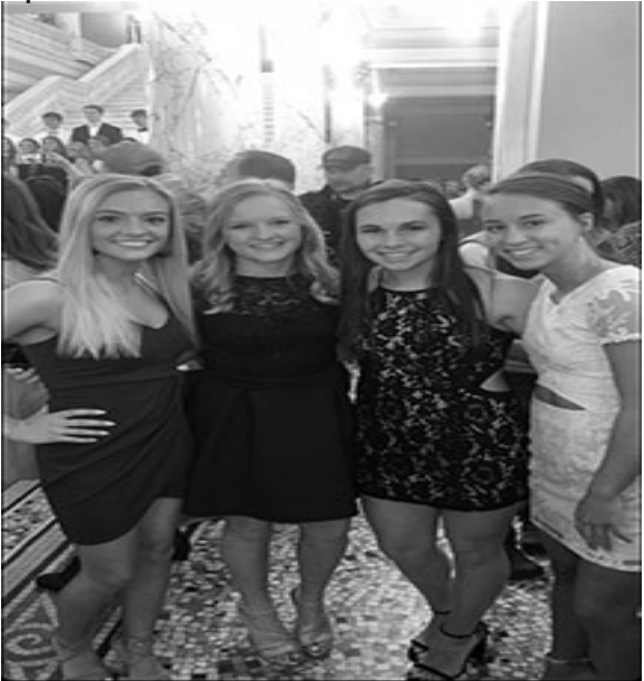
Members of the Lady Gov Gymnastic team take a picture at the state capitol.